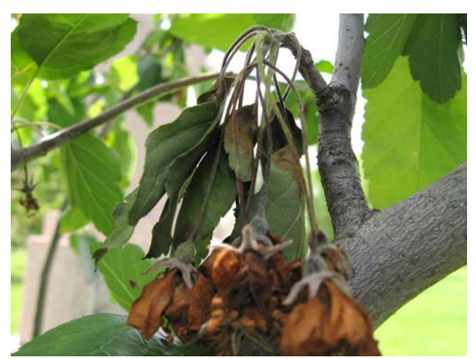
A newly infected branch with fire blight.

purchasing from local vendors and box stores. Some mail order catalogs list what rootstock the tree has been grafted onto or may even list more than one rootstock choice that may be ordered. With some research, this information can be useful for choosing rootstocks with desired characteristics. For further information concerning fire blight, access the following factsheet: <a href="http://extension.usu.edu/files/publications/factsheet/fire-blight-08.pdf">http://extension.usu.edu/files/publications/factsheet/fire-blight-08.pdf</a>. Information concerning varietal fire blight resistance can be found by variety in Table 1. Rootstocks with Geneva (or an abbreviation of the letter G) in the name are additionally resistant, but availability is limited. For more rootstock information see Table 3.