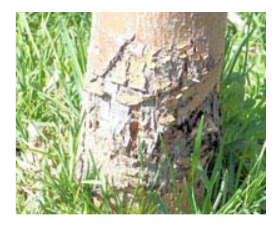
When turf is not removed, damage occurs from string trimmers and mowers that stress and cause trees to be excessively prone to pests and diseases.