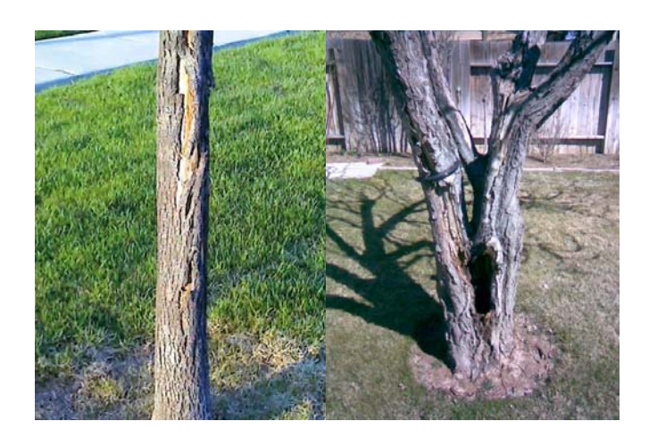
Examples of southwest winter injury.

years should be fertilized annually in late winter or early spring with approximately ½ cup of ammonium sulfate (20-0-0). This is equal to approximately 1 oz of actual nitrogen. Trees that have been in the ground for 4 years or more, should only be fertilized if needed. This can be determined by overall tree health, amount of